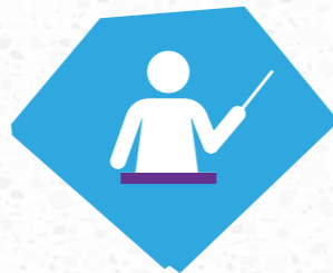
Teachers & non-formal educators