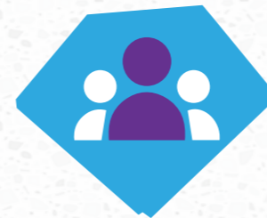
Students & young people